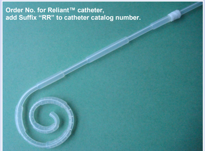
Tenckhoff Coil Reliant™ Catheters

Order No. for Reliant™ catheter, add Suffix "RR" to catheter catalog number.