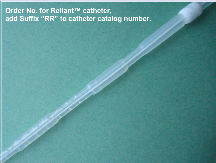
Tenckhoff Reliant™ Catheters

Order No. for Reliant™ catheter, add Suffix "RR" to catheter catalog number.