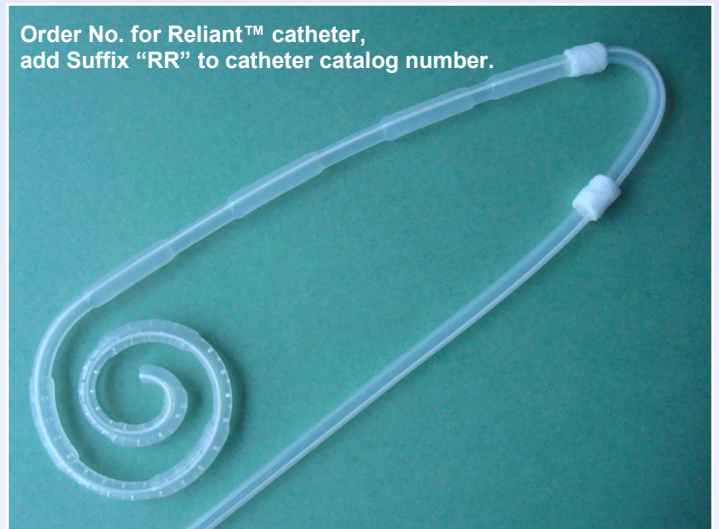
Swan Neck Coil Reliant™ Catheters

Order No. for Reliant™ catheter, add Suffix "RR" to catheter catalog number.